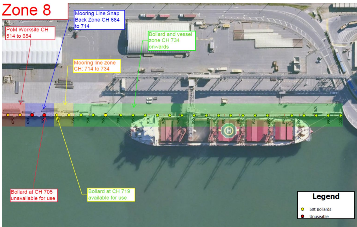
Appleton Dock E & F berth – Bollard availability during works